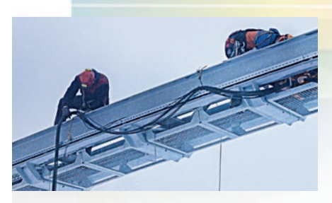
2014 World Junior Alpine Skiing Championships