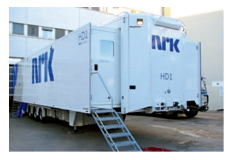
Belden Speeds Norwegian Broadcasting Corporation's Upgrade to HD

When Belden BNC High-Definition Broadcast Brilliance® Connectors are used in conjunction with Belden Professional Video Cables in fixed installations by an approved and certified Belden partner, Belden guarantees that these products will be free from manufacturing and/or material defects during the useable life (maximum 25 years) of the installation.