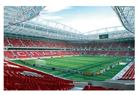
Belden Prepares Spartak's New Stadium to Broadcast 2018 World Cup

Sony Selects Belden to Meet SKY Italia's HD Needs